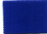
1.5 % o.w.f.