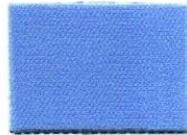
0.125 % o.w.f.