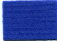
0.75 % o.w.f.