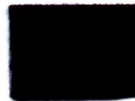
1.5 % o.w.f.