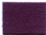
0.1 % o.w.f.