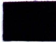
0.5 % o.w.f.