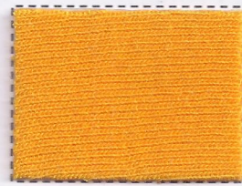
0.5 % o.w.f.