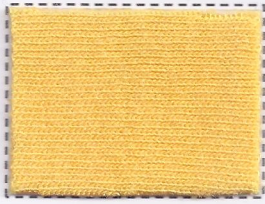
0.125 % o.w.f.