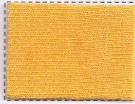
0.25 % o.w.f.