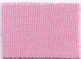
0.125 % o.w.f.