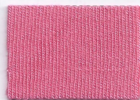
0.5 % o.w.f.