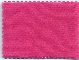
0.25 % o.w.f.