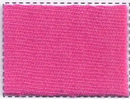
0.125 % o.w.f.