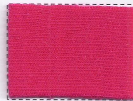
0.5 % o.w.f.