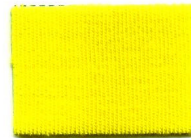
1.5 % o.w.f.