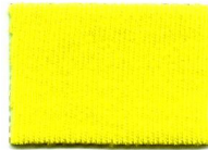
0.5 % o.w.f.