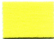
0.1 % o.w.f.